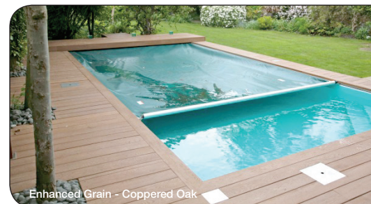
Enhanced Grain - Coppered Oak

Made using a blend of recycled material that make use of hard-to-use waste and reclaimed natural minerals. The manufacture of Millboard helps to conserve the earths resources as well as reducing landfill, and helping conserve mature hardwood forests.