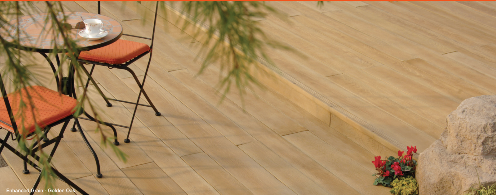
Enhanced Grain - Golden Oak