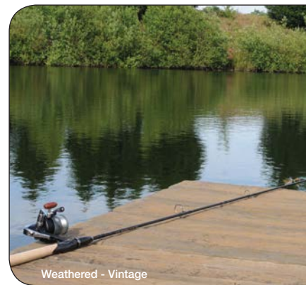
Weathered - Vintage