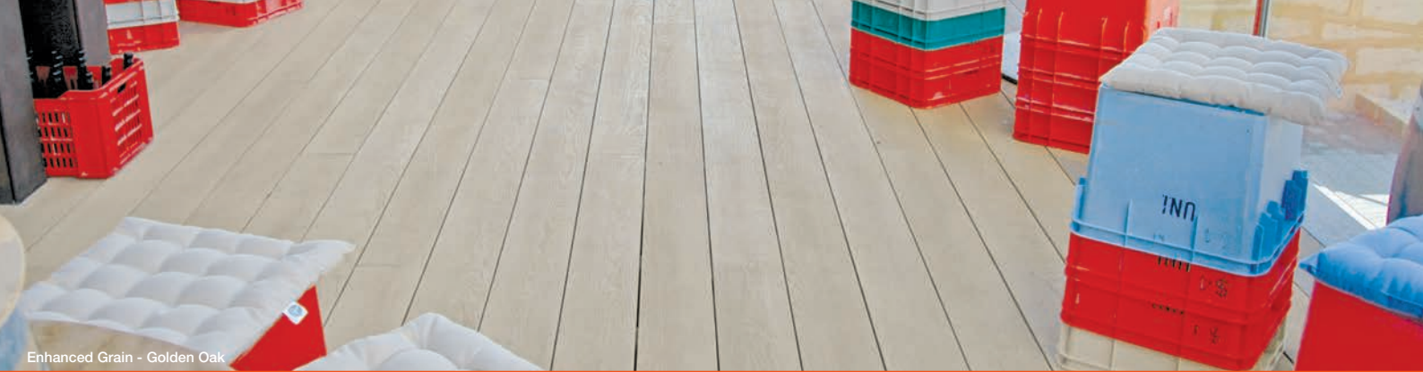
Enhanced Grain - Golden Oak