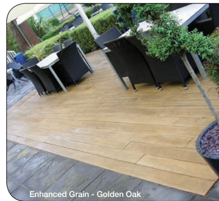
Enhanced Grain - Golden Oak